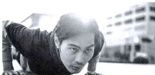
12 30-Day Challenges That Will Change Your Life