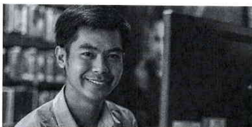
5 Traits of People With High Emotional Intelligence