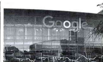
Analysis of 10,000 Reports Told Google to Train N Managers in These 6 Areas ...