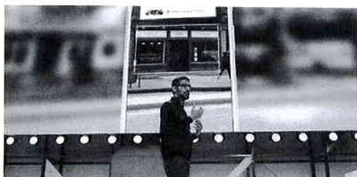
How Google's CEO Creates Brain-Friendly Presentations