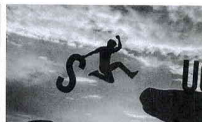
70 Powerful Habits That Will Get Your Life Back on