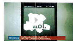
Starboard Letter Urges Yahoo Combination With AOL