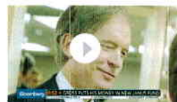
Bill Gross Puts Skin in the Game in New Janus Fund

Don't miss our annual Book of Lists celebration at the National Building Museum!